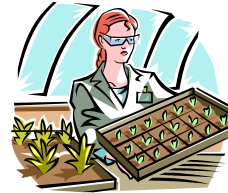
Greenhouse, Nursery, Sod

Parent/Guardian Name: _____ Phone: _____