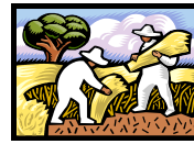
Cultivation, Preparation of soil