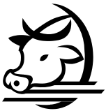
Feed Cattle, Processing, Packing

Do you currently work in agriculture, fishing or forestry? N/A If yes, please circle all that apply on the list below.