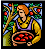
Harvest (fruit and vegetables)